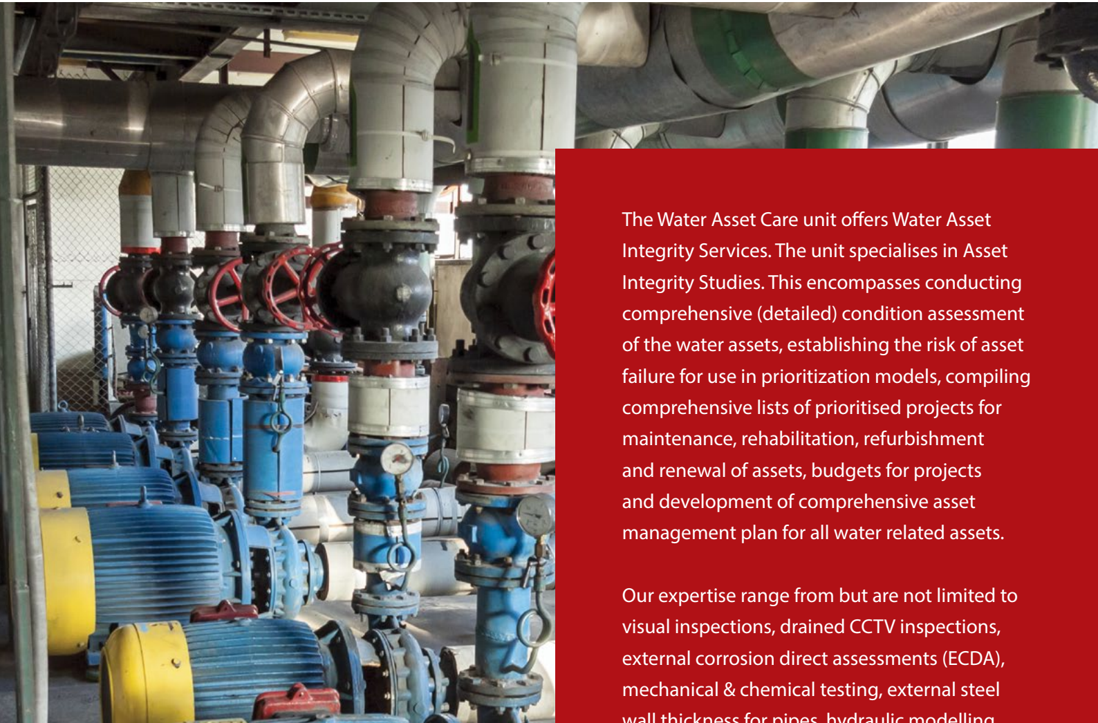
Water Asset Care