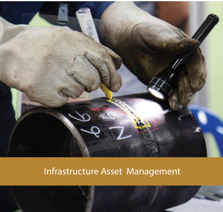
Infrastructure Asset Management

We offer Infrastructure Asset Management solutions based on the International Infrastructure Management Manual (IIMM). Our expertise complements the broader infrastructure planning and design expertise of BID that enables it to provide a whole of life solution to its clients.